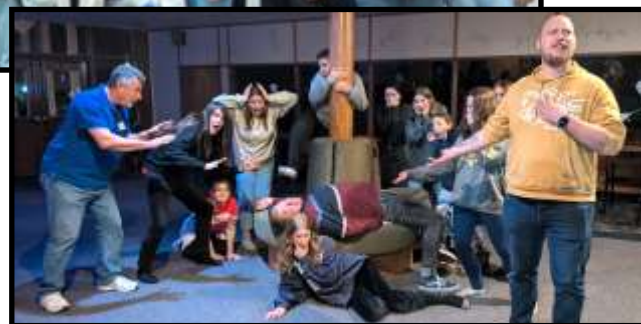
Seven of our youth attended the conference's Next Steps East Retreat in November!