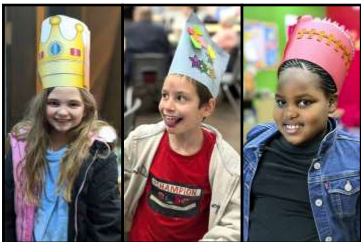
Warm Heart Kids celebrate Christ the King Sunday