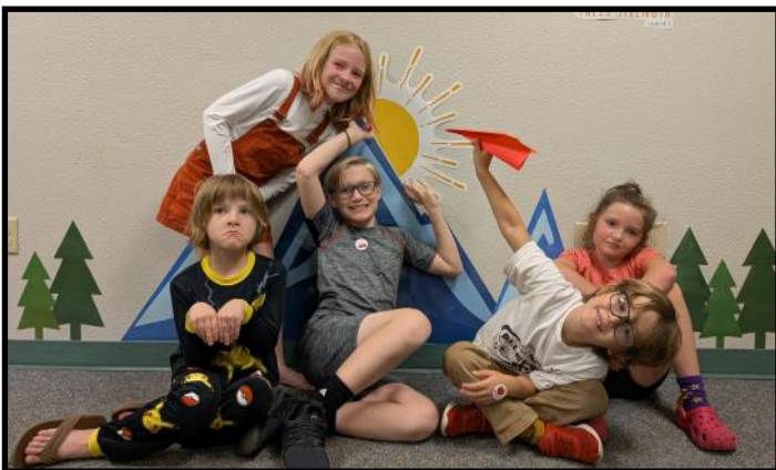
Bible Builders Fun

Fall Festival Saturday, October 25, 2:00 p.m.