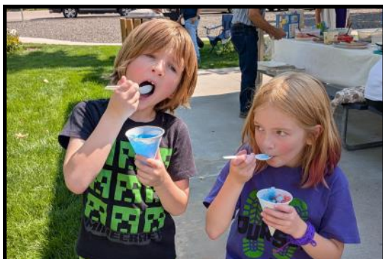
Snapshots from our September Kick-Off Picnic