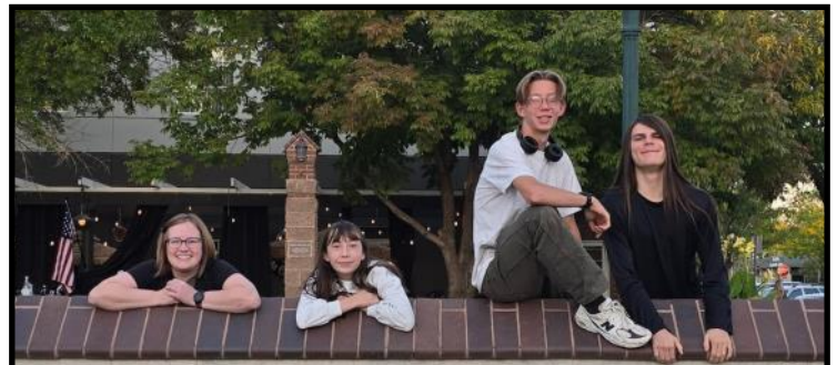
Photo Scavenger Hunt Night