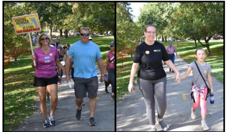
A few familiar CROP walkers from 2023