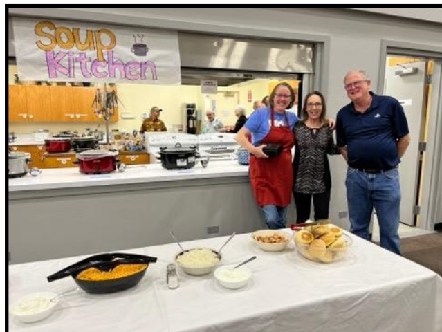
Souper Saturday Bazaar 2023