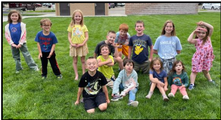
The Bible Builders spending some time in the park!

Our Wednesday evening Bible Builders kicked off the year with learning about being a "bucket filler" and reading A Spot of Kindness . We will begin to dive into the New Testament starting this month. I'm so excited for our group to explore the Bible! Join us whenever you're able, 6:00 - 7:30 p.m. on Wednesday evenings.