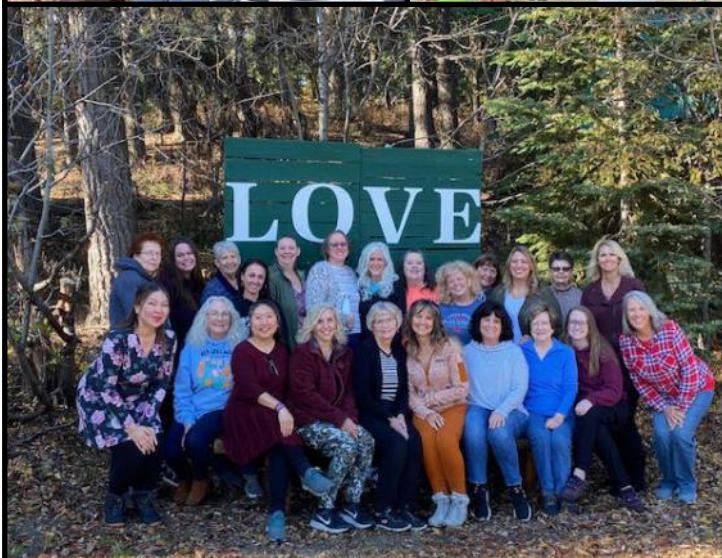
Women's Retreat 2023