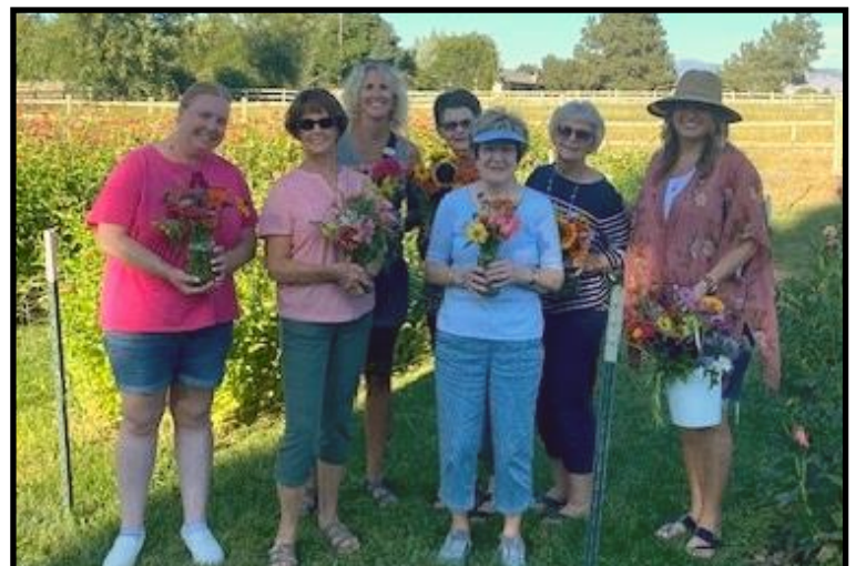
Ladies Night Out at Blue Sky Flower Farm!