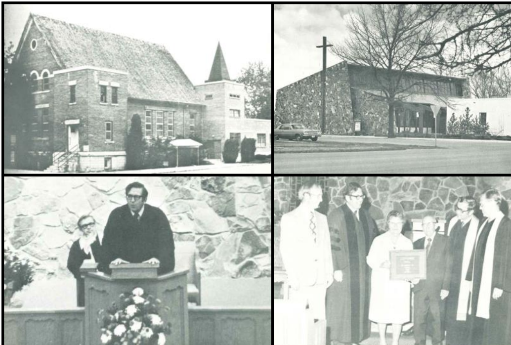
Top Left: Our old Sanctuary building. Picture taken shortly after the construction of the Education Wing.

P.S. Did you know our sanctuary turns 50 years old next month? We're having a celebration on November 17th, and we want to take the opportunity to also celebrate any members who have been with us for those 50 years. If that includes you and you haven't already heard from us, give the office a call!