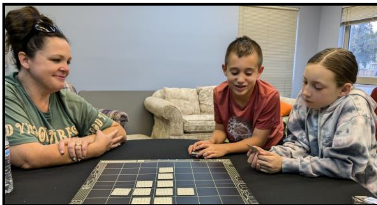
The Inbetweeners play a board game together.