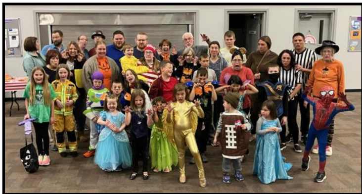
Our 2023 Fall Festival crowd.

*We also need volunteers for this awesome event!