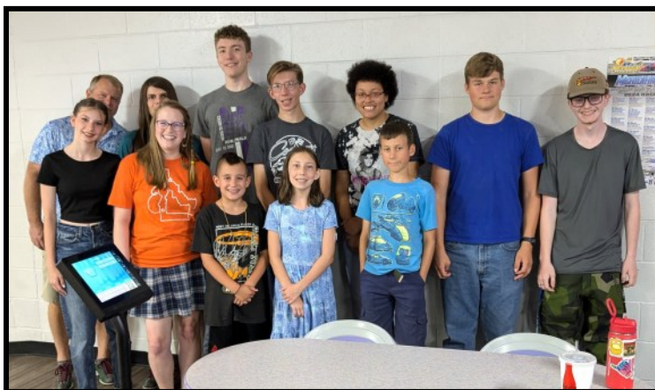
Warm Heart Youth Bowling Night