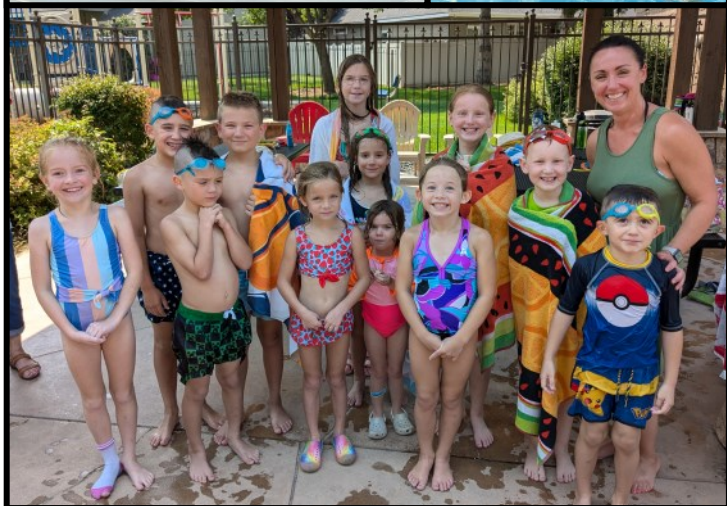
Warm Heart Kids Pool Party