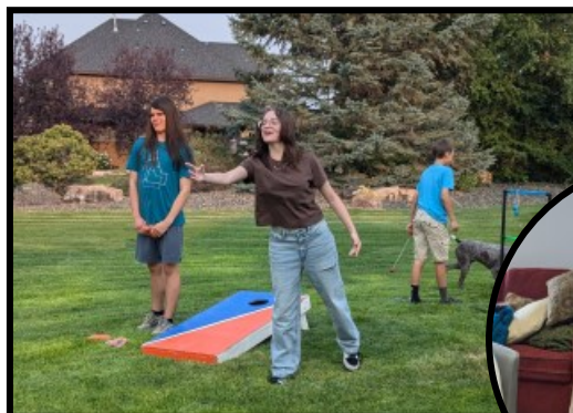
Olympics Party & Youth Night