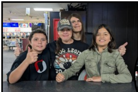
Youth Group Bowling!