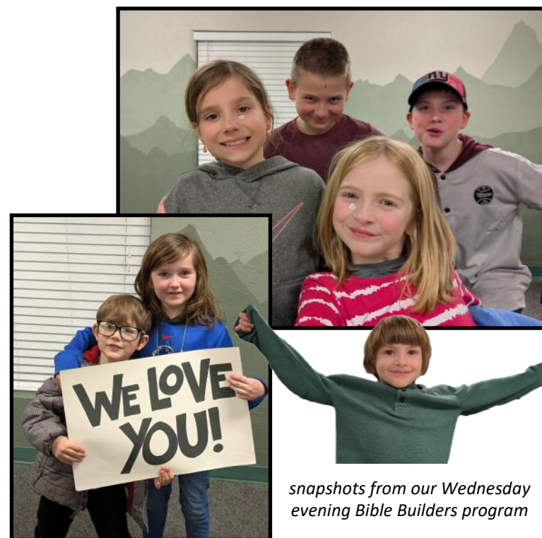
snapshots from our Wednesday evening Bible Builders program