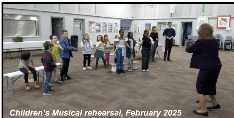
Children's Musical rehearsal, February 2025

Children's Musical - The Warm Heart Kids will be offering their spring musical, "Sermon on the Mount", on Sunday, April 27th, at the 11:15 a.m. service. If you have a child (4 yrs - 5th grade) who would like to participate, just contact me for more info. We are doing our best to accommodate all kids who wish to participate, and we will be having both Wednesday evening and Sunday afternoon rehearsals to do that. ALL are welcome!