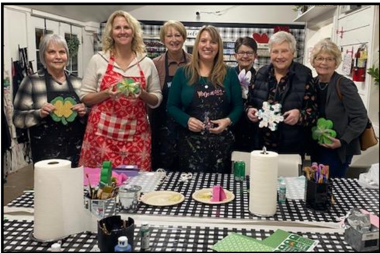
Last month's Ladies Night Out crew showing off their creations!

The Ladies Night Out group will be joining the United Women in Faith for the Days for Girls event on Saturday, March 8th, at 10 a.m. This is a sewing event to assemble hygiene kits for young women around the globe without access to basic feminine care products. If you cannot sew, do not worry! There is a job for everyone. Please let me know if you have any questions and make sure to RSVP with the office.