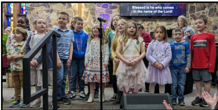
Children singing with the choir on Palm Sunday 2024

Palm Sunday - Palm Sunday is just around the corner! Here at the Church of the Warm Heart, our children lead us in a Palm parade with live palms at both services! The Angels Alive choir will be singing WITH the Celebration Choir (9:30AM) that morning (April 13) too! Make plans to attend.