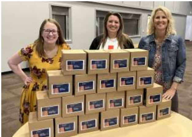
Thank you for your donations towards our young adult care packages. The packages are on their way!