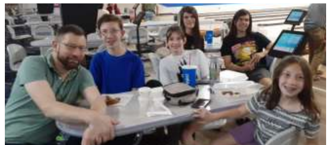
Thanks for joining us for bowling this month!